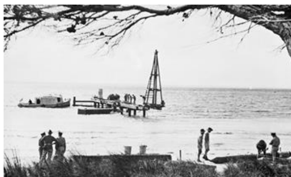
7 Army Troops Company constructing Sulphur Bay Jetty in March 1943.